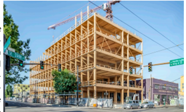
2021 Juror's Favorite Award: District Office

We've been working diligently on the SEAO website to accept online submissions of your projects for consideration in the 2021 SEAO Excellence in Structural Engineering Awards. The online submission platform was created as a direct result of the feedback we received from the survey that was sent out to the membership earlier this year. The member participants wanted a process for submittal that was convenient and not too time consuming.